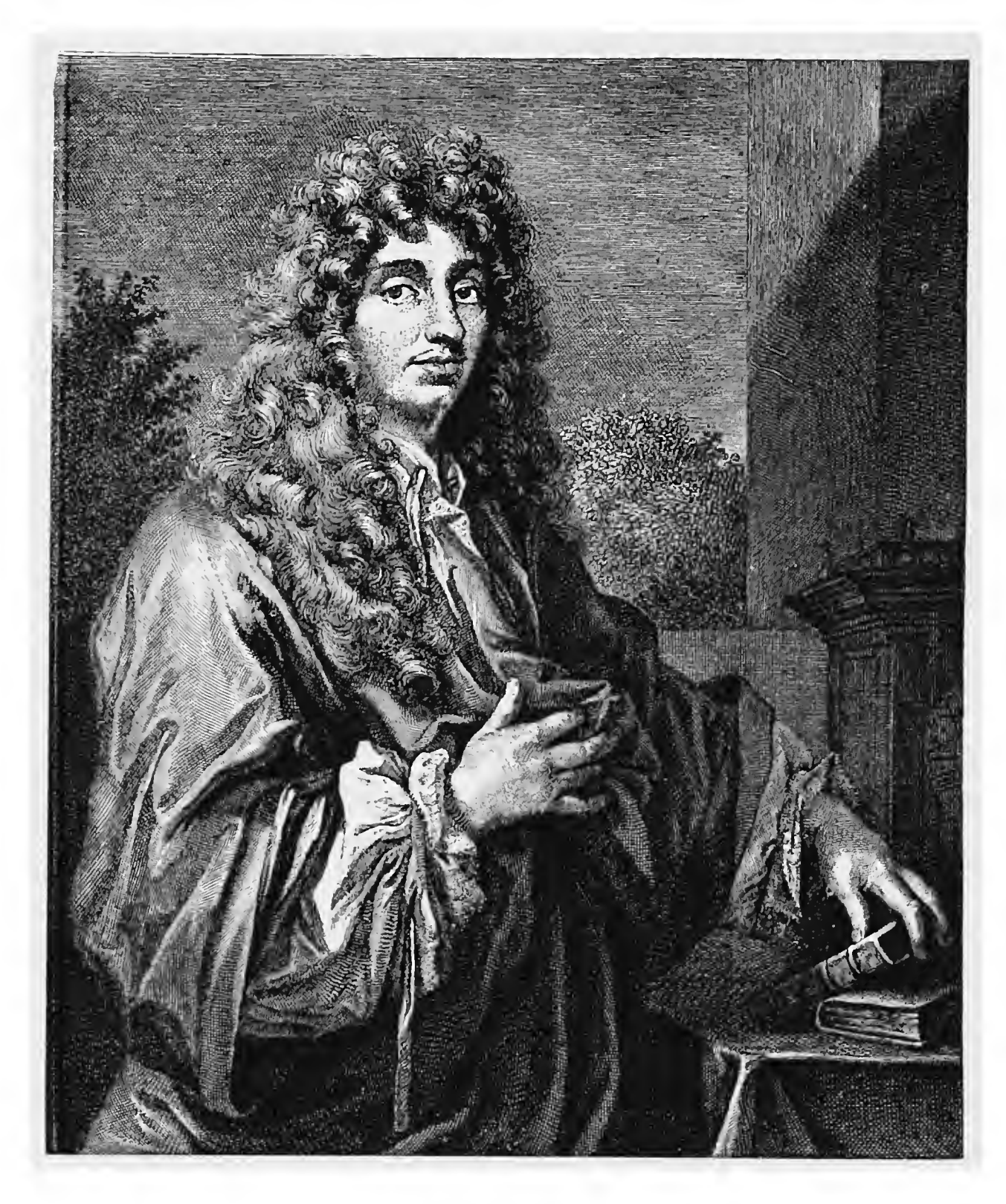
HUYGENS From the engraving by Edelink